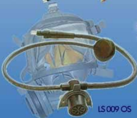
LS 009 OS