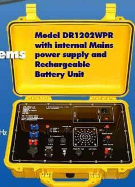
Model DR1202WPR with internal Mains power supply and Rechargeable Battery Unit

LINK SUBSEA LTD UNIT 8 LIGHTBURN TRADING ESTATE ULVERSTON CUMBRIA LA12 7NE TEL: +44(0)1229 480606 FAX: +44(0)1229 480707 EMAIL: sales@linksubsea.com